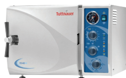
Manual M series