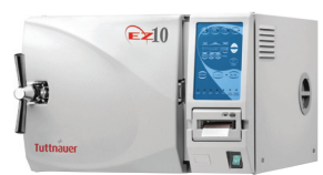
Fully automatic sterilizer