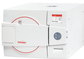
Fully automatic series